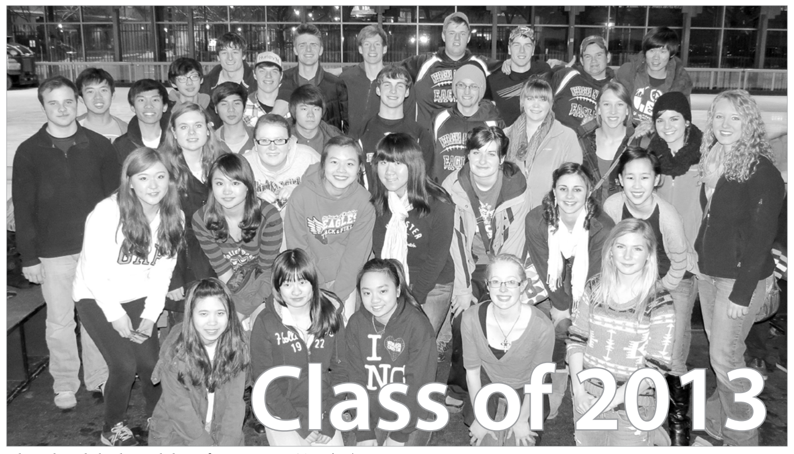
Class Colors: Black, Silver, and Blue