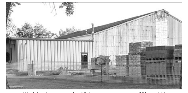
Work has begun on the ADA restrooms as part of Phase 2A!

Follow us on Facebook, Twitter, and Instagram for up-to-date info on the Preservation Project and Phase 2A!