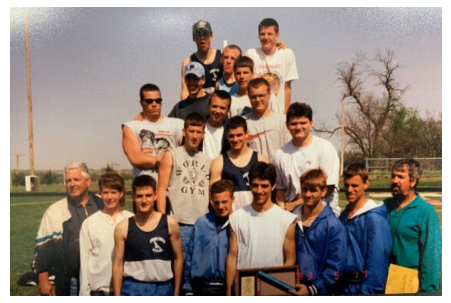
Boys' Track 1998 – Goldenrod Conference Champions