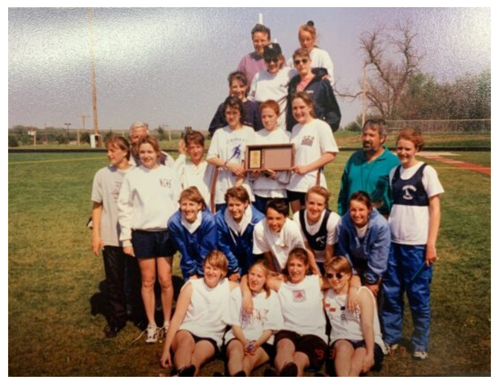
Girls' Track 1998 – Goldenrod Conference Champions