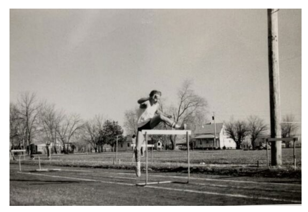
1980 – An NC track athlete practices his hurdling form on the dirt track.