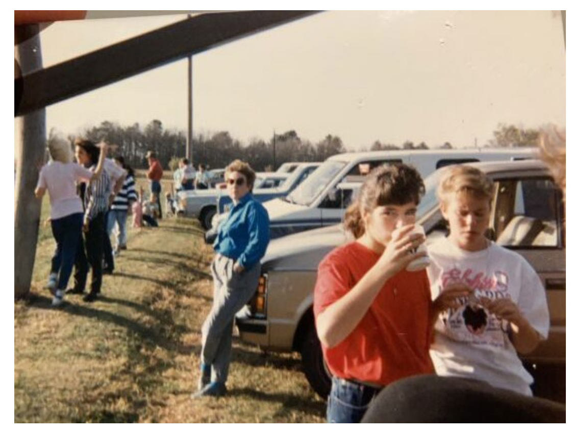
Homecoming has been hosted in the fall in conjunction with a home football game and other home competitions like volleyball and cross country. Students, alumni, spectators, and guests gather around the field to cheer on the team.