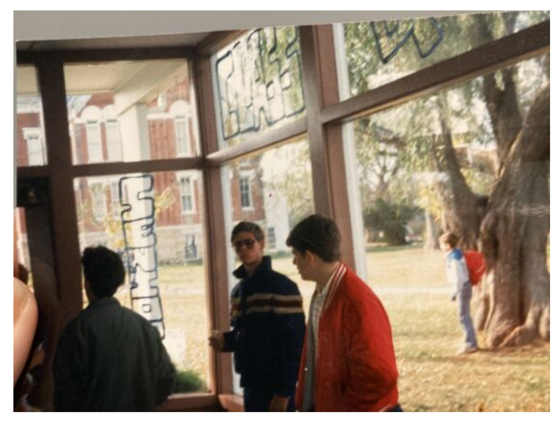
A Homecoming tradition throughout parts of the school's history included decorating the gymnasium and its entrance. Classes were assigned different corners of the gym with the entry way being reserved for the seniors. Note the decorated windows in the photo.