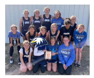
April 13 - Osceola Junior High Invitational The girls placed first and the boys finished third.

April 17 - Osceola Varsity Invitational The boys and girls teams won first place.